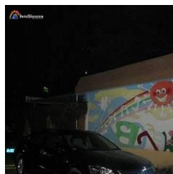
With white light